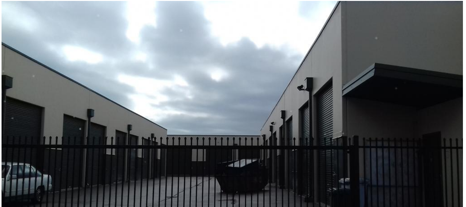
Unit 21, 28 Tesla Rd, Rockingham